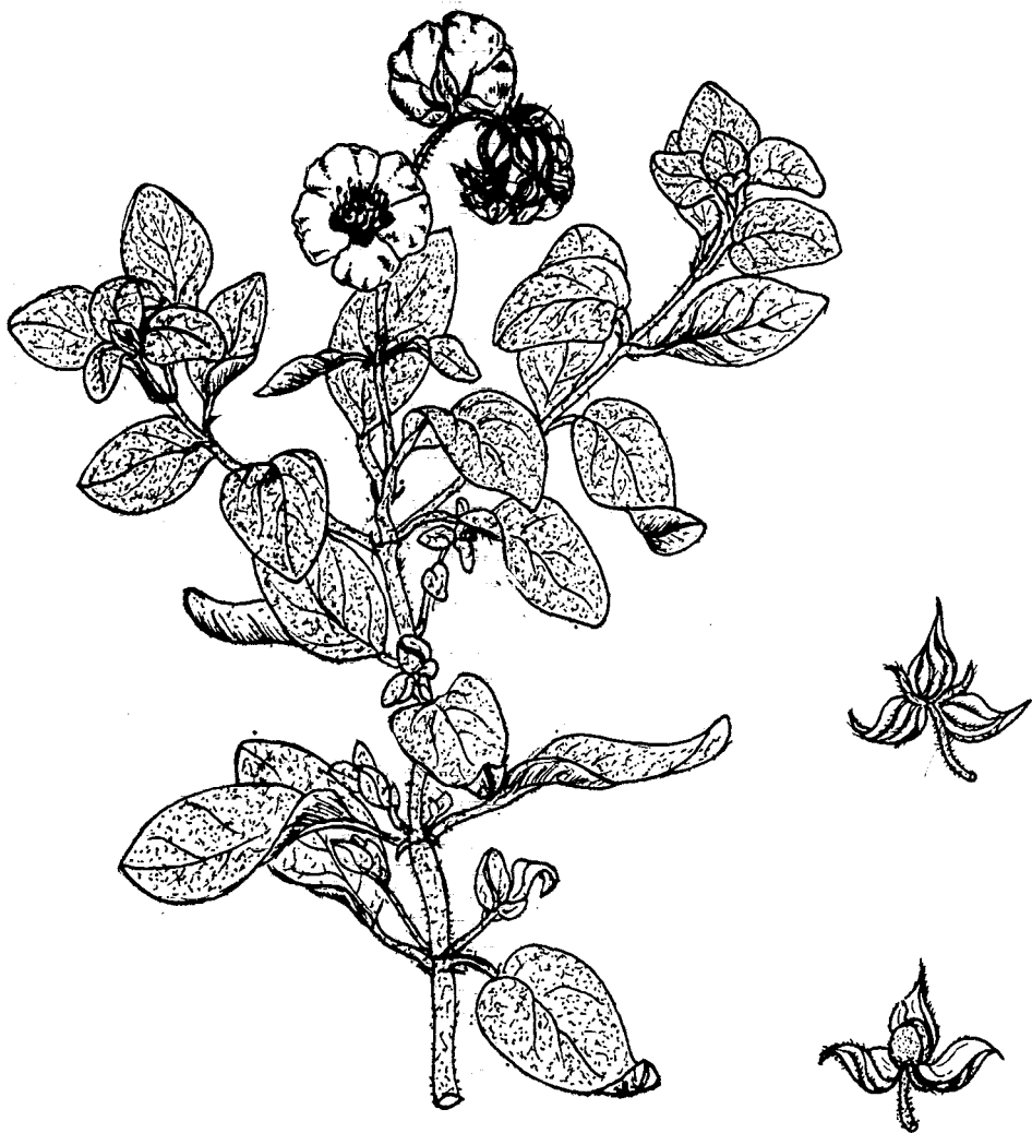
Fig. 1 Helianthemum tholiforme sp. nov.

Holotype : Gran Canaria, Barranco de Guayadeque, rocky slopes below cliffs 1000 m. April 19th 1976, D. Bellamy et al. , Herbarium of Royal Botanic Gardens Kew (K). Isotypes : Herbarium of Jardín Botánico Viera y Clavijo (TAF) and British Museum (BM).