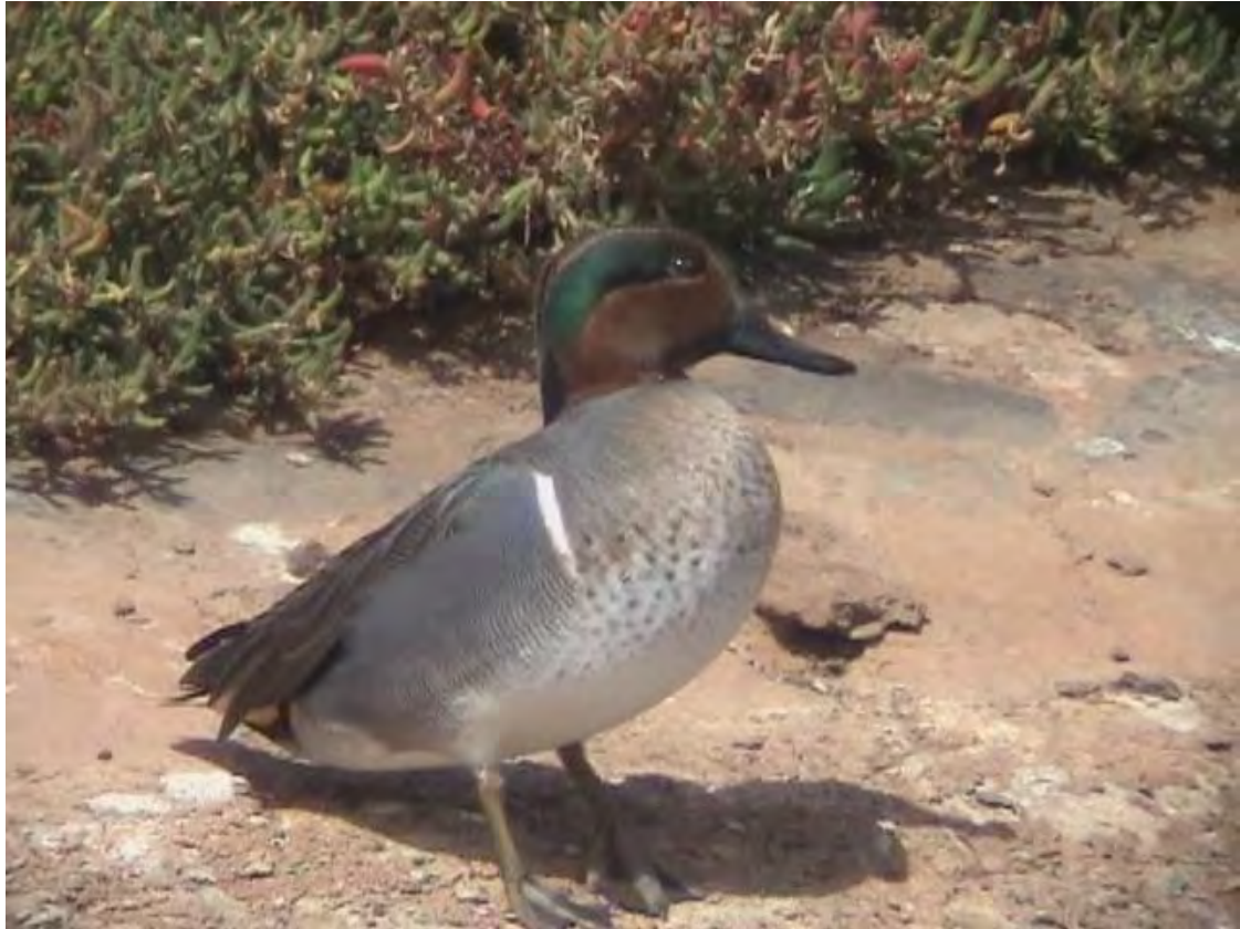
Fig. 4. Anas carolinensis , sewage ponds, São Vicente, 13 January 2005 (Dick Forsman)