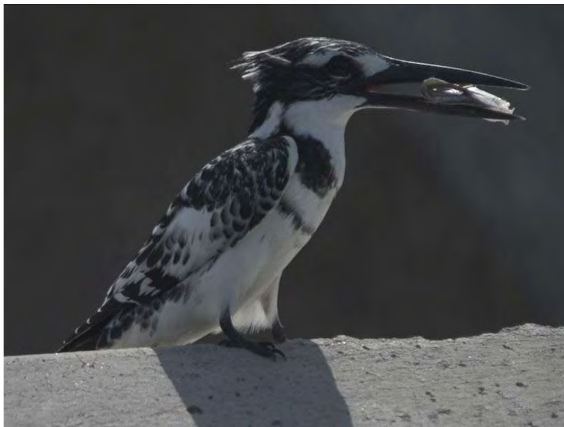
Fig. 32. Ceryle rudis , São Filipe, Fogo, 19 October 2004 (Richard White)