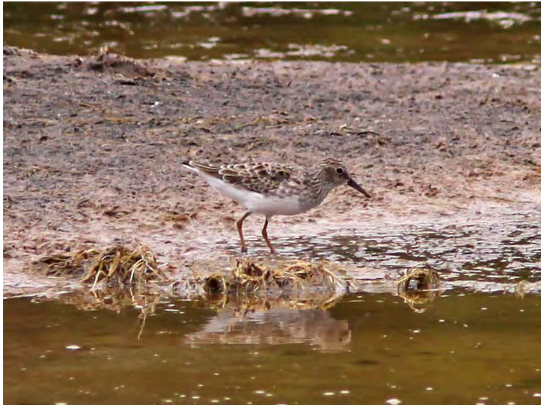
Fig. 21. Calidris minutilla , Rabil lagoon, Boavista, 15 April 2009 (Richard Ek)