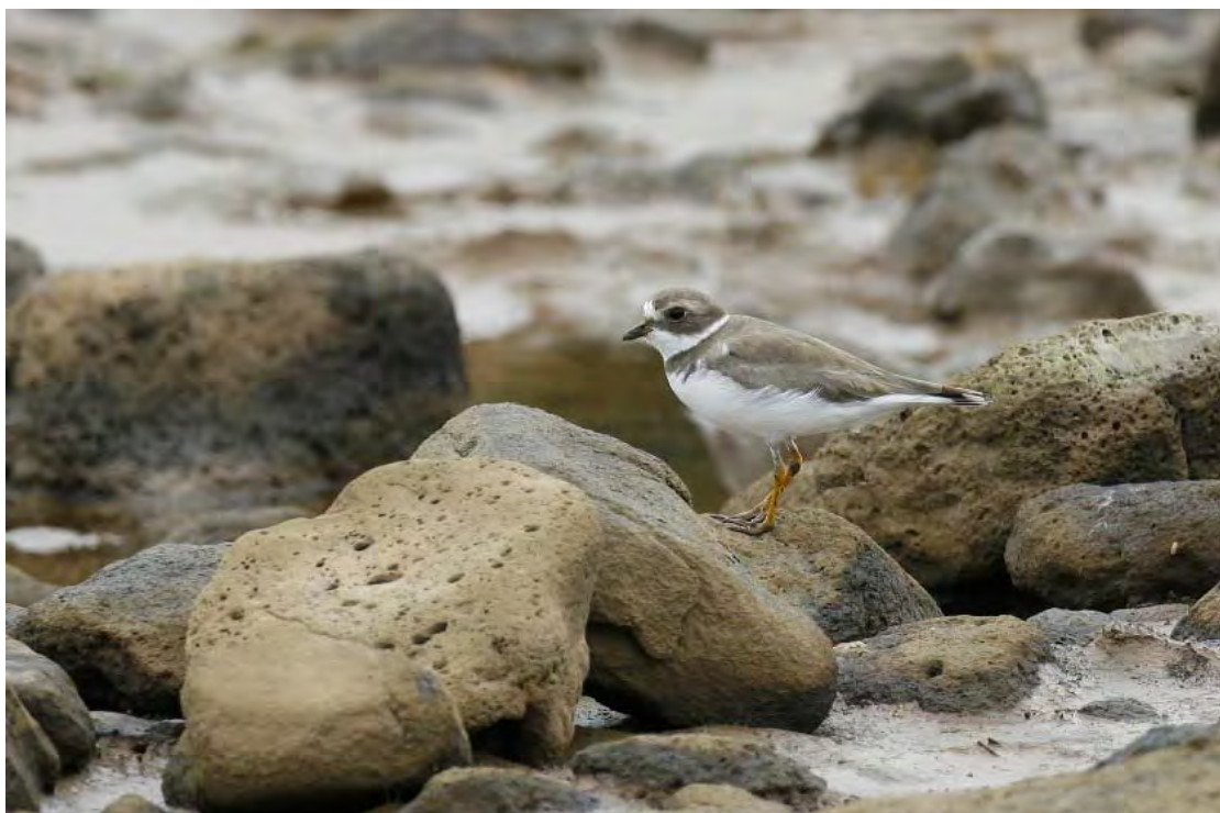
Fig. 19. Charadrius semipalmatus , Tarrafal, Santiago, 17 October 2006 (Edwin Winkel)