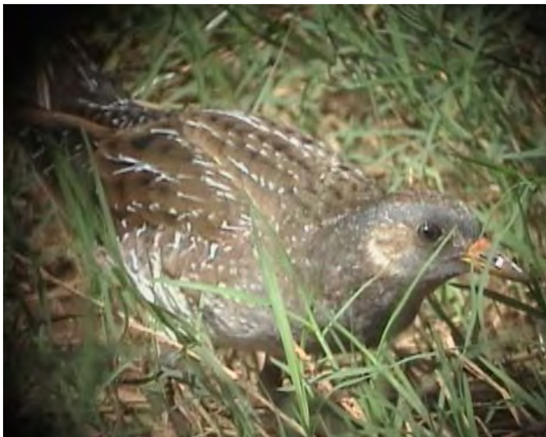
Fig. 17. Porzana porzana , sewage works, São Vicente, 13 January 2005 (Dick Forsman).