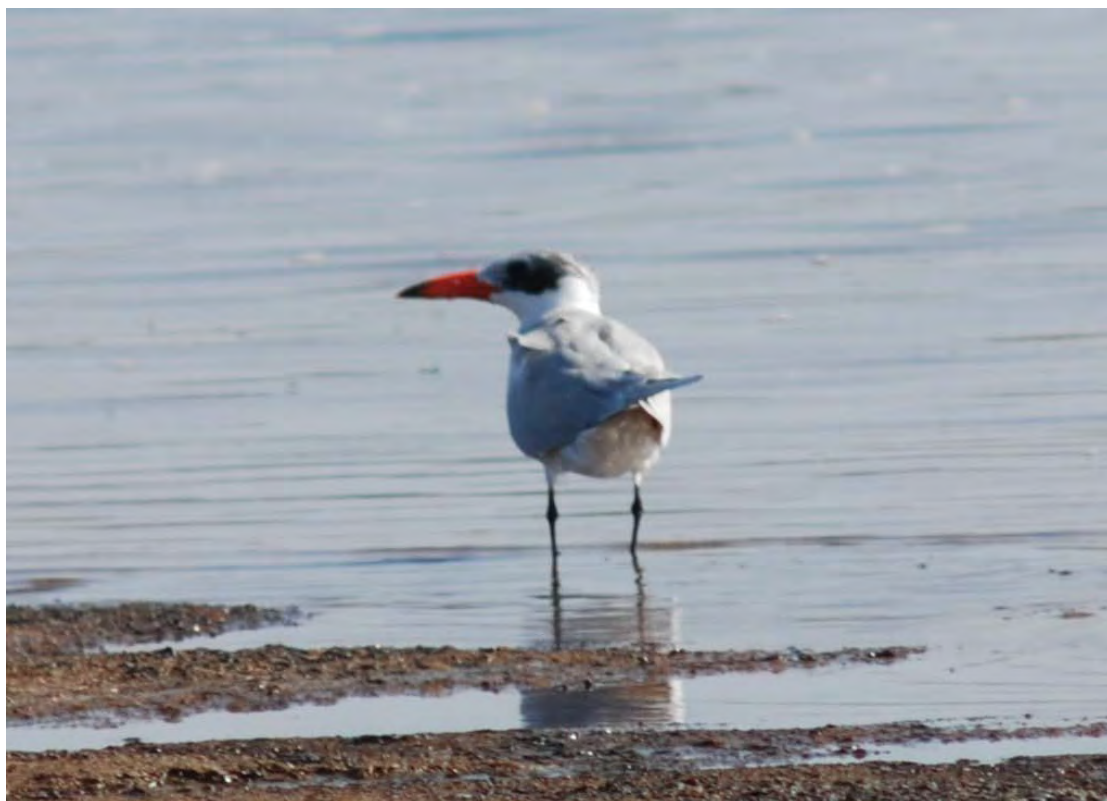
Fig. 28. Sterna caspia , saltpans, Maio, 15 November 2007 (Pedro López Suárez)