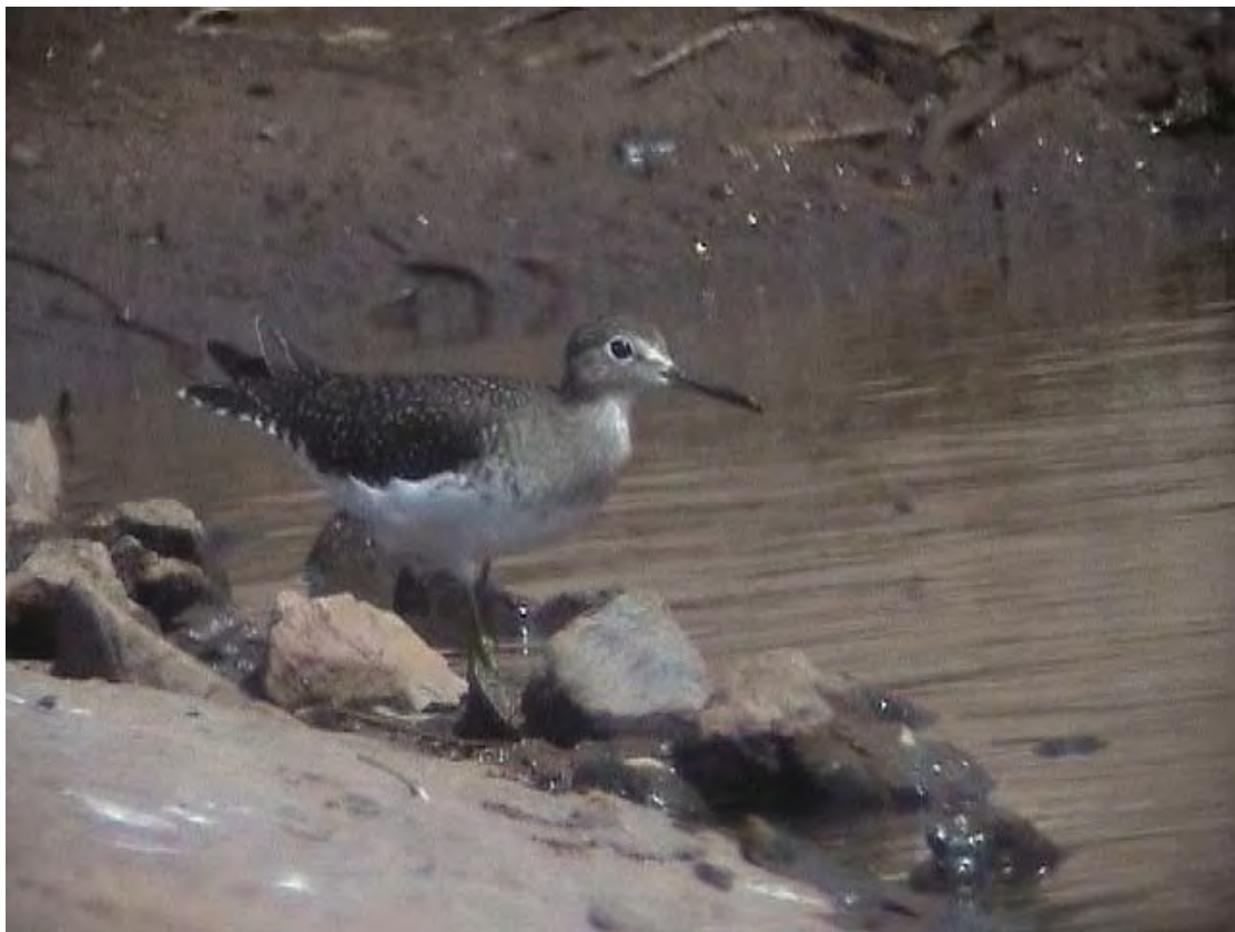
Fig. 26. Tringa solitaria , sewage works, São Vicente, 13 January 2005