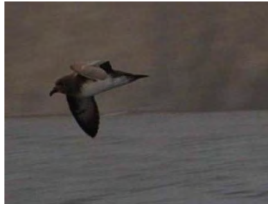
Fig. 7-8. Pterodroma arminjoniana , off southern Brava, 30 September 2008