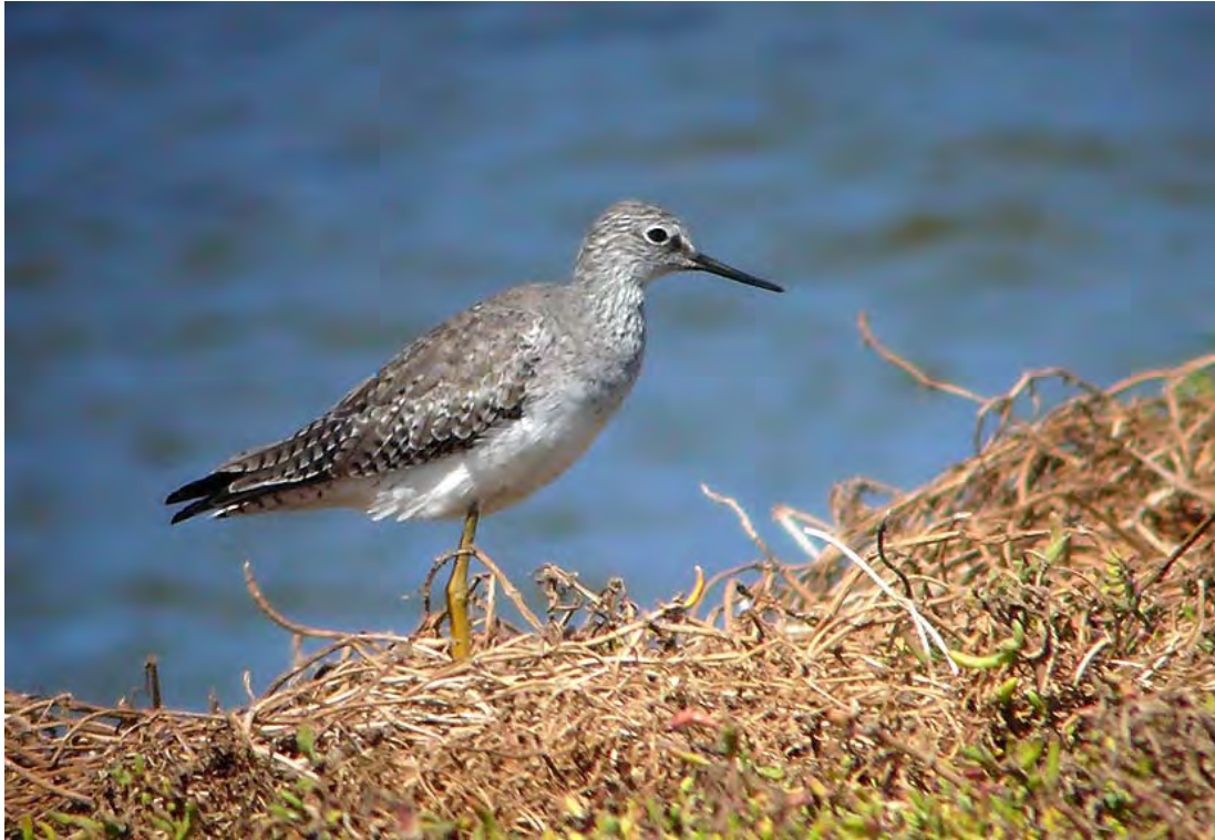
Fig. 25. Tringa flavipes , sewage ponds, São Vicente, 1 February 2007 (Dick Forsman)