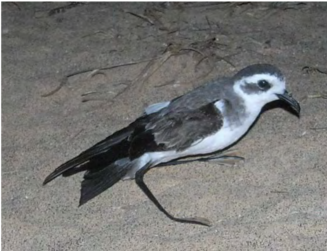
Fig 1. Pelagodroma marina , Laje Branca, Maio, 16 April 2009 (Robert Kelsh)

endemic taxa, new or rare records for a particular island, as well as other noteworthy observations.