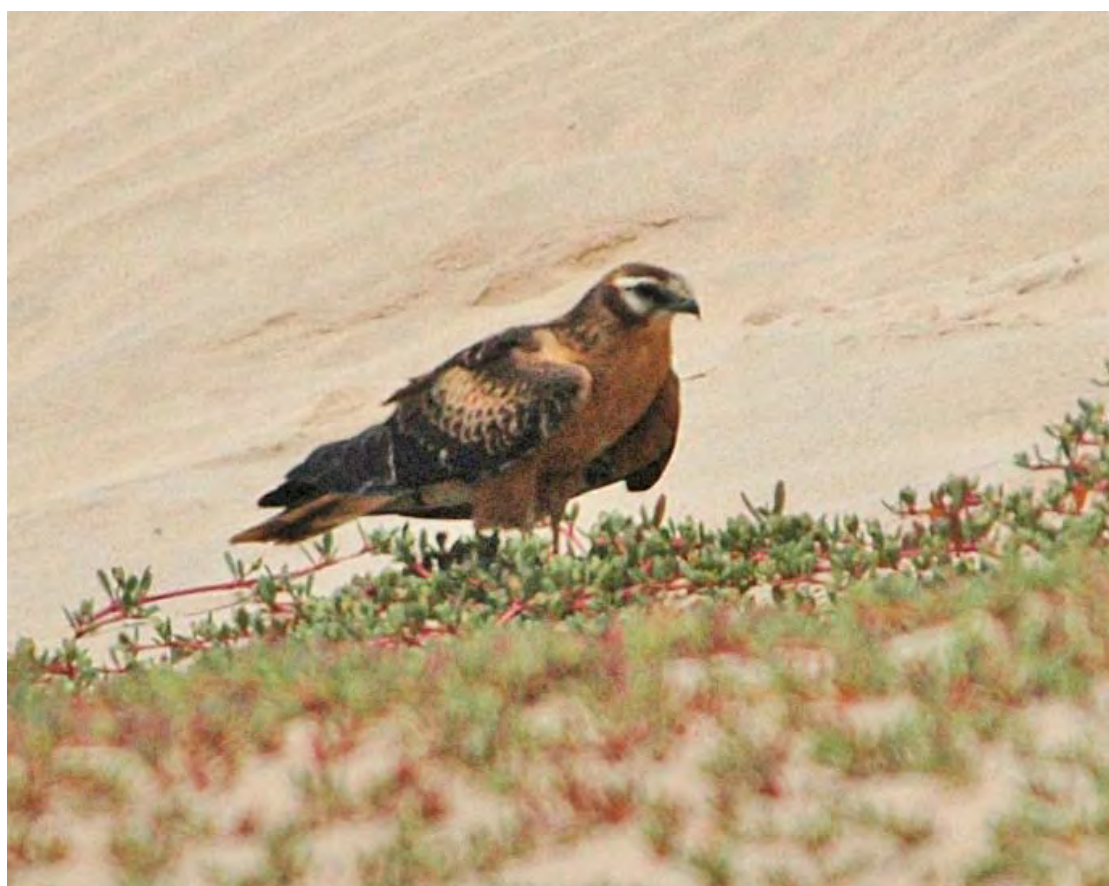
Fig. 16. Circus pygargus , Santa Maria, Sal, 16 September 2007 (Robin Brace)