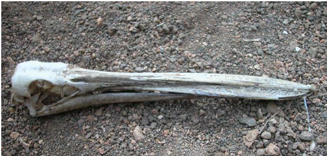
Fig. 11. Pelecanus onocrotalus , found at Olho do Mar, Boavista, 12 September 2007 (Pedro López Suárez)

possibly, the bird present on Santiago in March moved to Boavista later on, but as there is no certainty about this, each island record is counted separately. These are the first records of White-breasted Cormorant since 1924. There are scanty 19 th Century records, lacking in detail, from São Vicente, Raso, São Nicolau and Boavista. The single 20 th Century record is of an immature female collected on Boavista, 17 March 1924. P. lucidus is a locally common breeding bird from Mauritania to Guinea. Although considered resident, some dispersal evidently takes place, as demonstrated by the 2007 Cape Verde records.