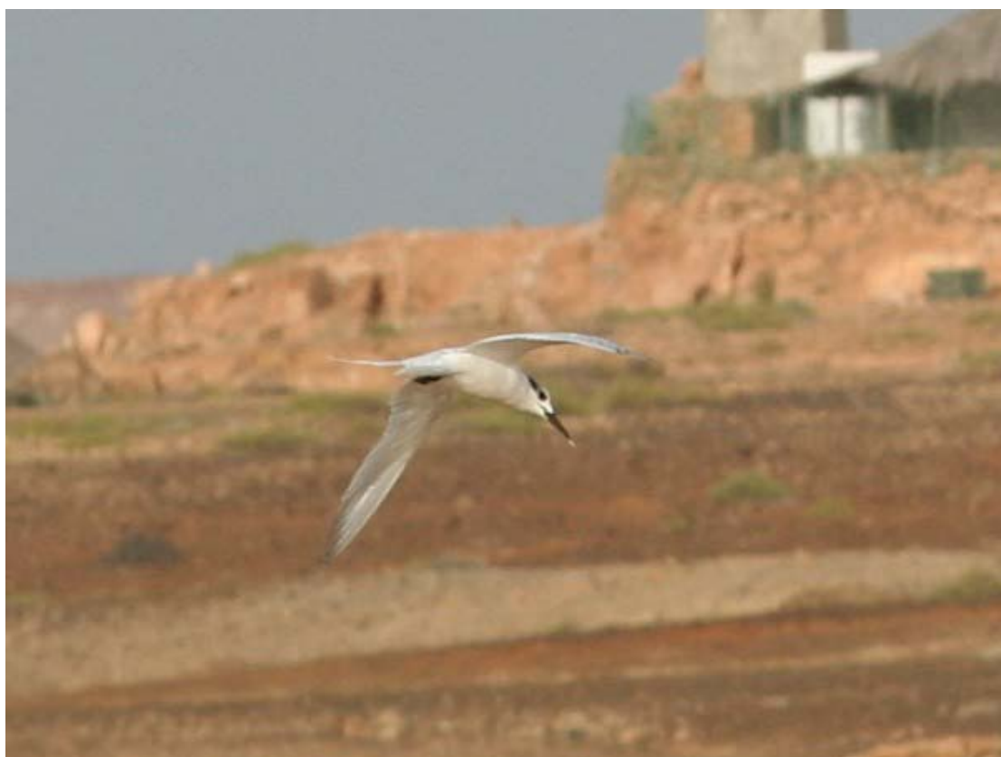
Fig. 29. Sterna sandvicensis , Ribeira da Madama, Sal, 4 December 2008 (Simon Tickle)