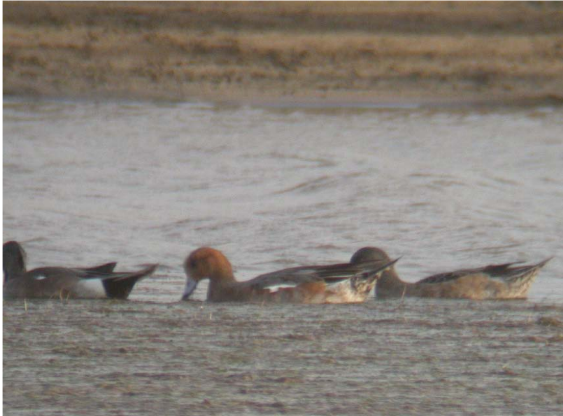
Fig. 3. Mareca penelope and M. americana, Casas Velhas, Maio, 1 January 2005