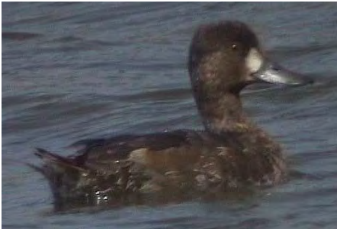
Fig. 6. Aythya affinis , sewage ponds, São Vicente, 13 January 2005 (Dick Forsman)

(0, 3) SÃO VICENTE: two females at the sewage ponds, 12 March 2003 (RP), and again two females there, 10-20 December 2007 (YBa, CGr). Ring-necked Duck has been recorded (November, December, March) from São Vicente (2) and Sal (1).