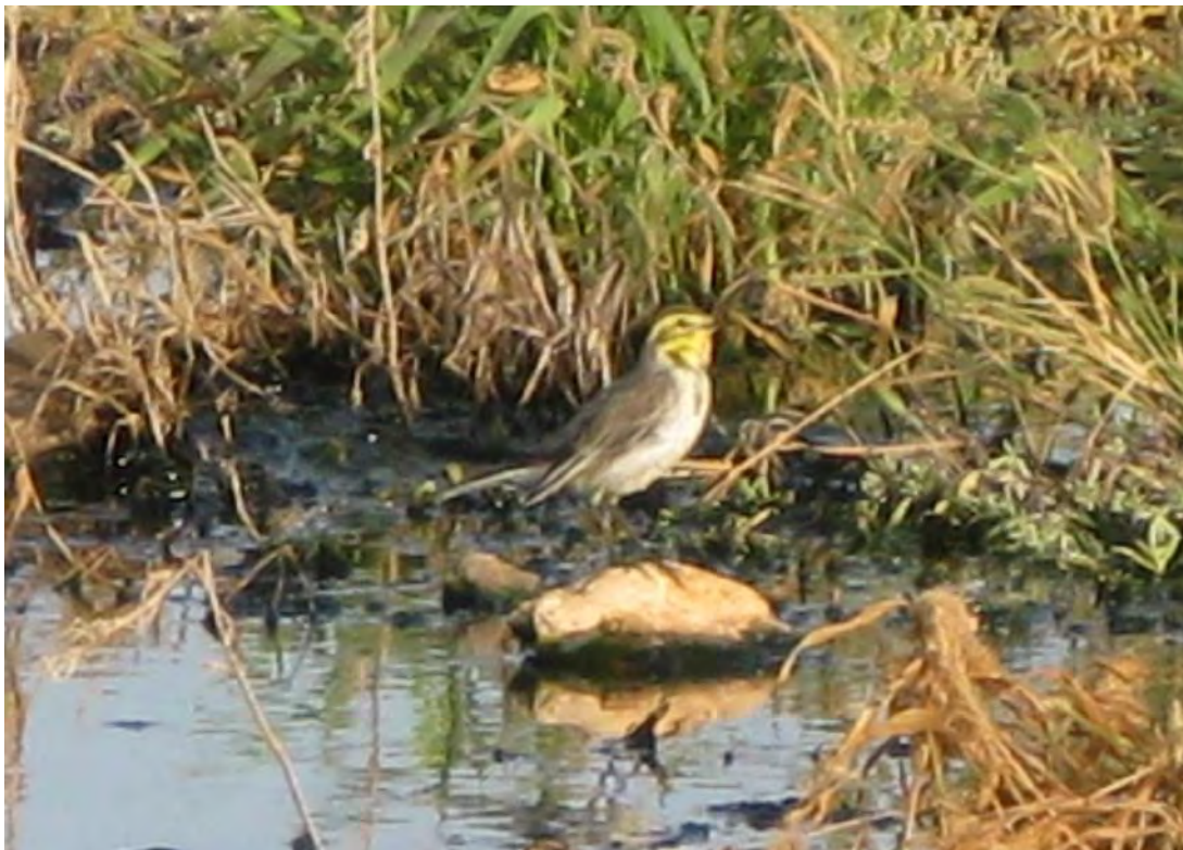
Fig. 35. Motacilla citreola , Santa Maria, Sal, 10 January 2008

7-10 January 2008 (CGr), and again two there, 1 March 2008 (HK). Red-throated Pipit has been recorded (December-March) from São Vicente (3), and Sal (3).