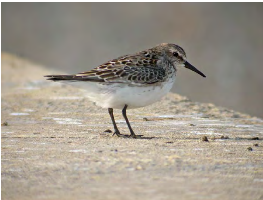
Fig. 22. Calidris fuscicollis , sewage works, São Vicente, 3 November 2005 (Kris De Rouck)