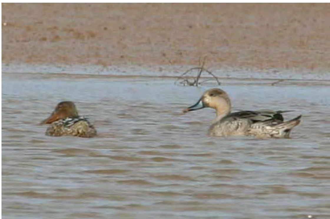
Fig. 5. Anas clypeata and A. acuta , Ribeira da Madama, Sal, 4 December 2008