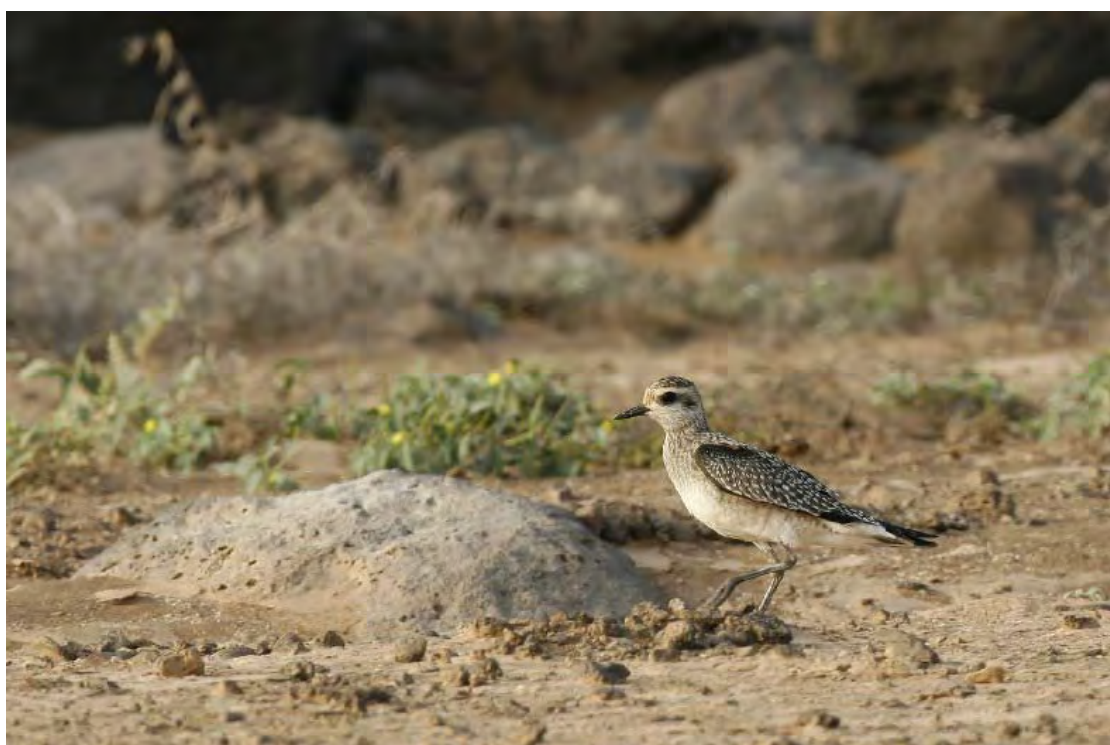
Fig. 20. Pluvialis dominicus , Raso, 21 October 2006