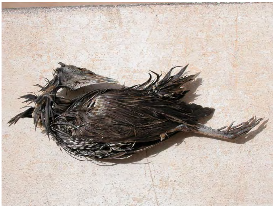
Fig. 18. Crecopsis egregia , found at Ilhéu dos Pássaros, Boavista, 4 February 2004 (Pedro López Suárez)