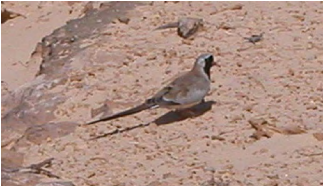
Fig. 30. Oena capensis , Ponta de Varandinha, Boavista, 2 December 2006

(0, 2) BOAVISTA: a male at Ponta da Varandinha, 2 December 2006 (PLS). This is the second record of Namaqua Dove, a common resident and intra-African migrant in the Sahel zone, the previous being of one on Maio, 21 July 1995.