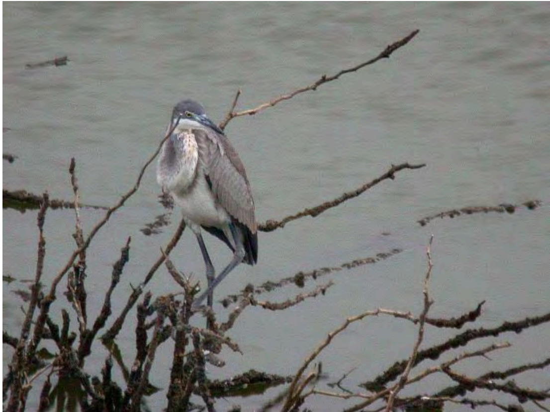
Fig. 14. Ardea melanocephala , Barragem de Poilão, Santiago, 21 March 2009

(0, 2) SANTIAGO: 1-2 at Barragem de Poilão, American origin. The only previous record 21 March-7 April 2009 (JL, RE). As the of Great Egret was of one on Boavista, 9 birds had dull dark legs, they likely were of March 1999. Afrotropical or Palearctic rather than