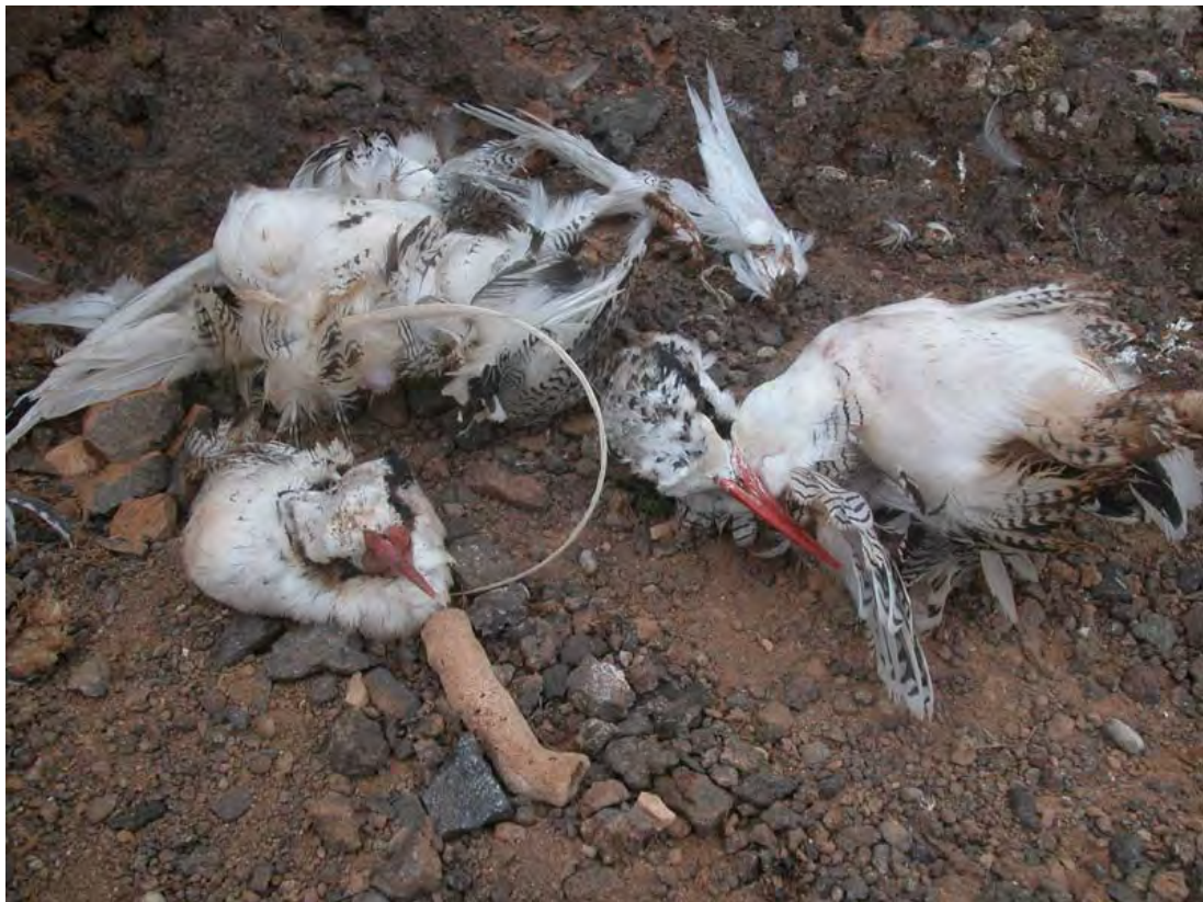
Fig. 2. Phaethon aethereus , victims of vandalism, Boavista, 5 March 2007

The records from Ilhéu dos Pássaros, São Vicente, are the first there in recent times and an inspection of the islet – situated at the entrance to the main port of Cape Verde and thought to be devoid of seabirds since the mid-19 th century – is warranted. The tropicbirds at Ponta do Sol, Boavista, suffer from predation by both humans and feral cats, while on Raso (a Nature Reserve by law) human destruction of tropicbirds is rampant. No recent counts of breeding sites on Brava and Ilhéus do Rombo are available.