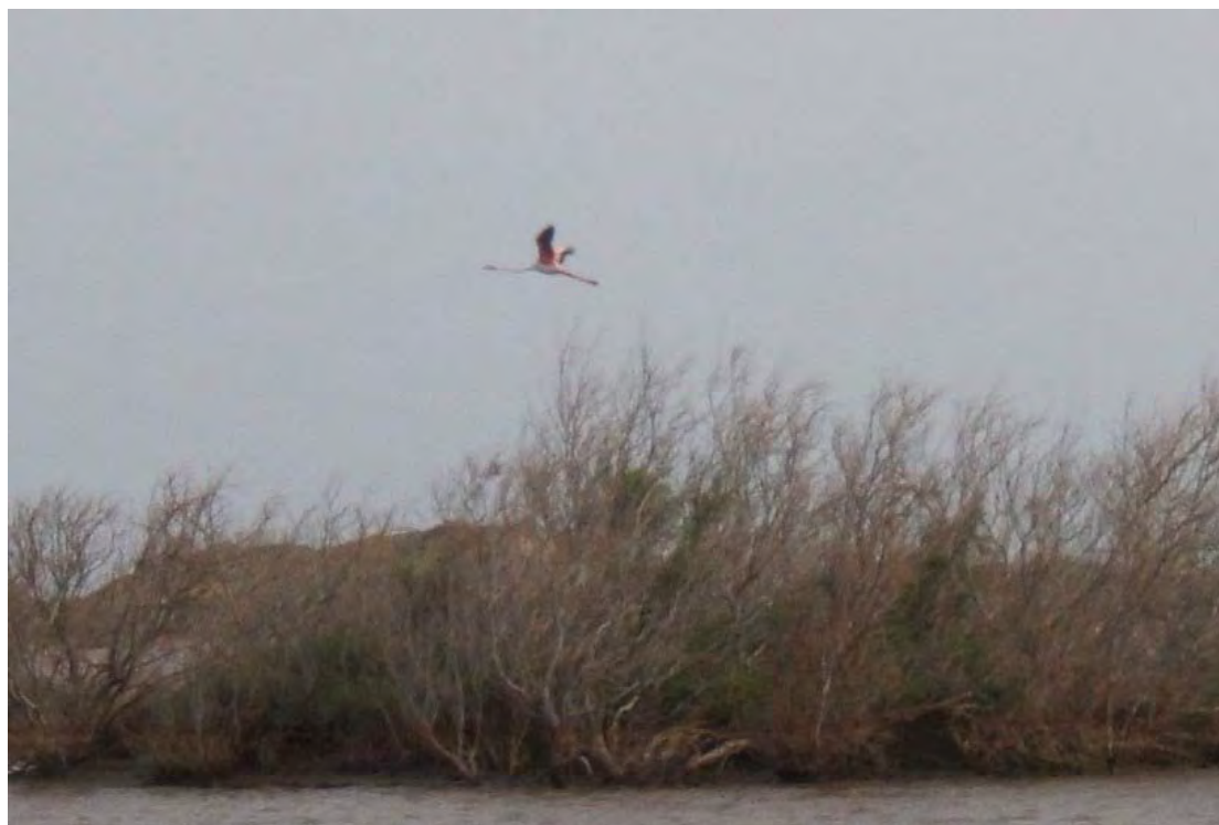
Fig. 15. Phoenicopterus roseus , João Barrosa, Boavista, 17 October 2008 (Saray Jimenez Bordón)