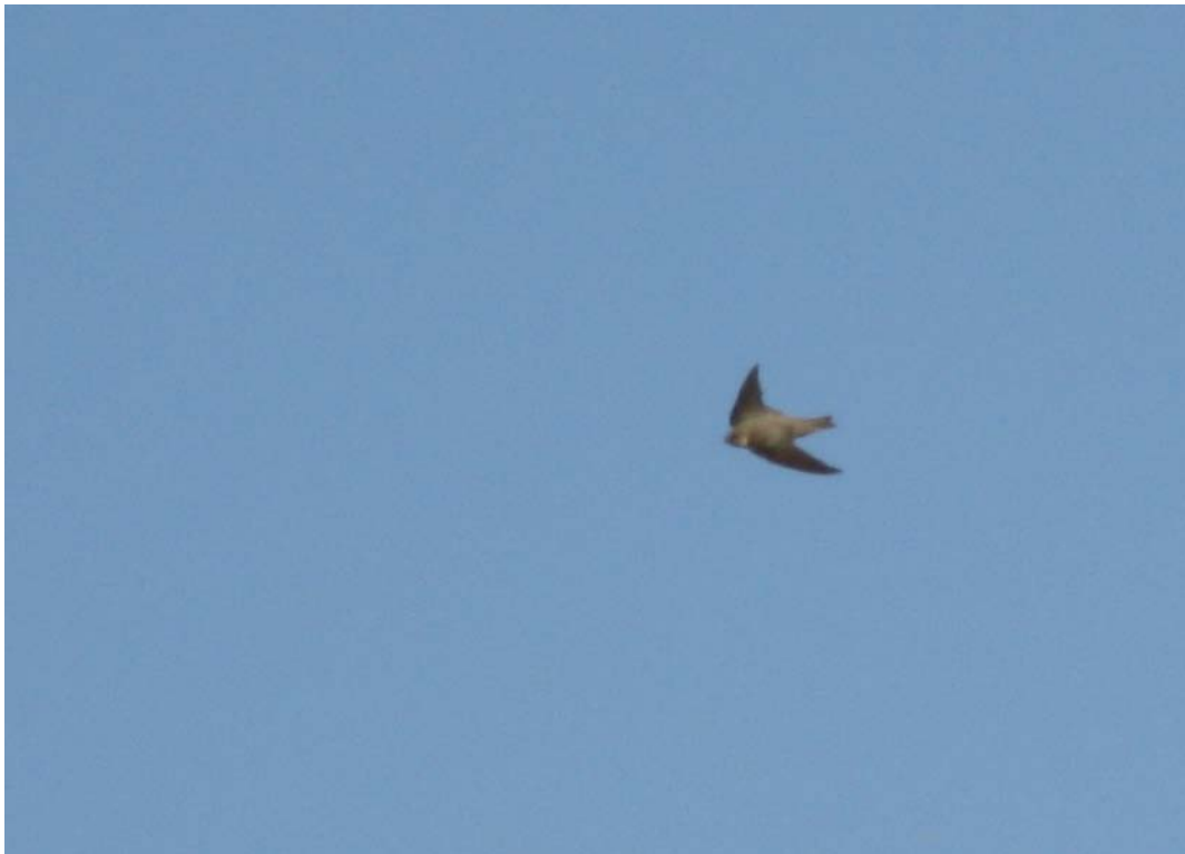
Fig. 34. Ptyonoprogne rupestris , Ribeira da Fontona, Sal, 8 January 2008

(0, 1) SAL: one at Ribeira da Fontona, 8 January 2008 (CGr). This is the first record of Crag Martin for the Cape Verde Islands. In West Africa, it is a rare Palearctic winter visitor to Mauritania and northern Sénégal and a vagrant in The Gambia (Lamarque 1988, Borrow & Demey 2001).