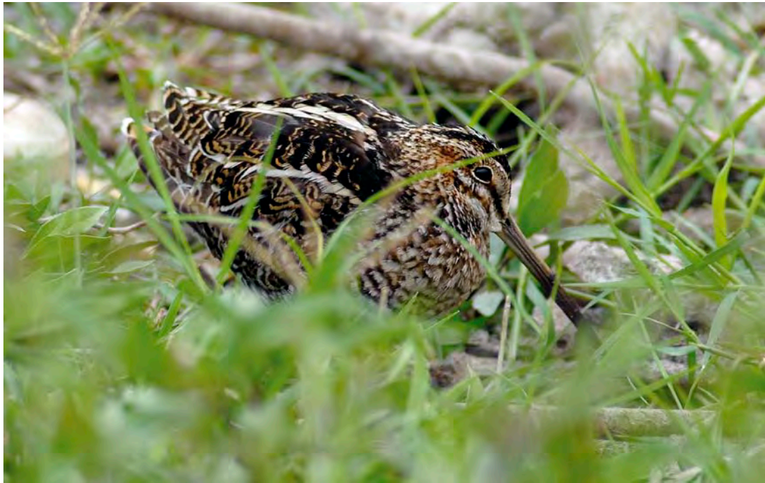
Fig. 24. Gallinago delicata , Barragem de Poilão, Santiago, 26 March 2007 (René Pop)