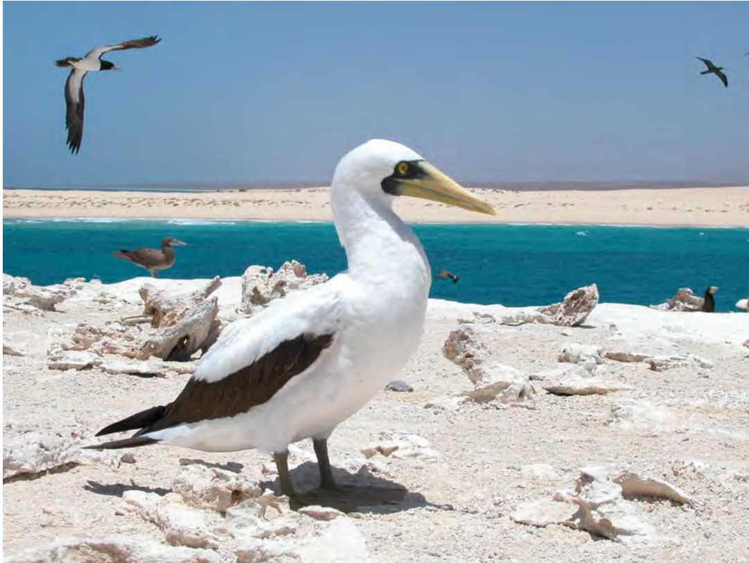
Fig 9. Sula dactylatra , Ilhéu de Curral Velho, Boavista, 22 April 2005 (Pedro López Suárez)