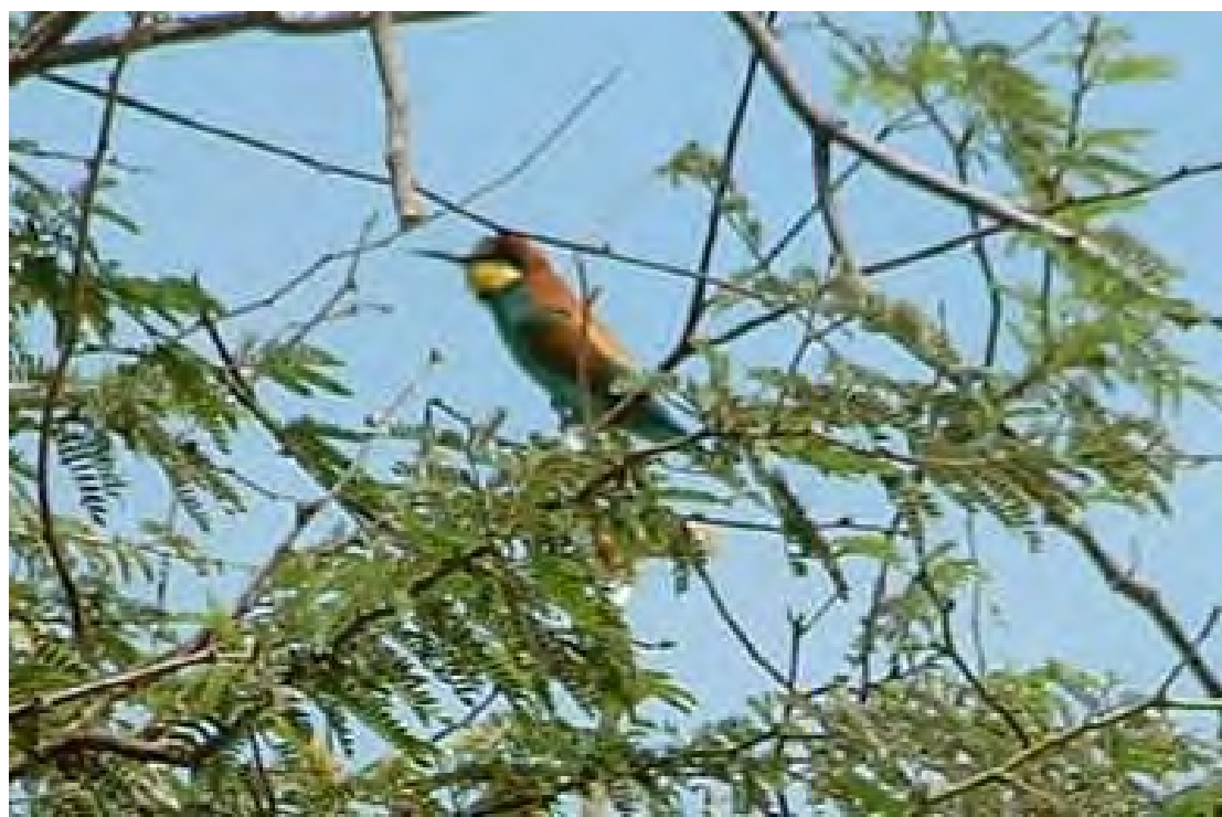
Fig. 33. Merops apiaster , João Barrosa, Boavista, 7 April 2006