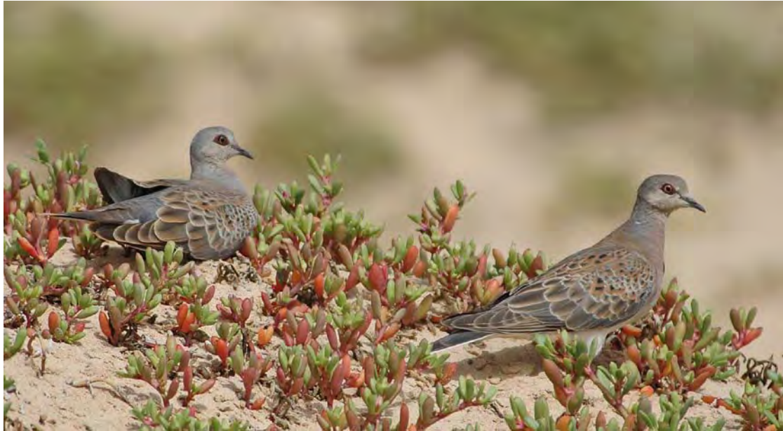
Fig. 31. Streptopelia turtur , Santa Maria, Sal, 17 September 2007 (Robin Brace)