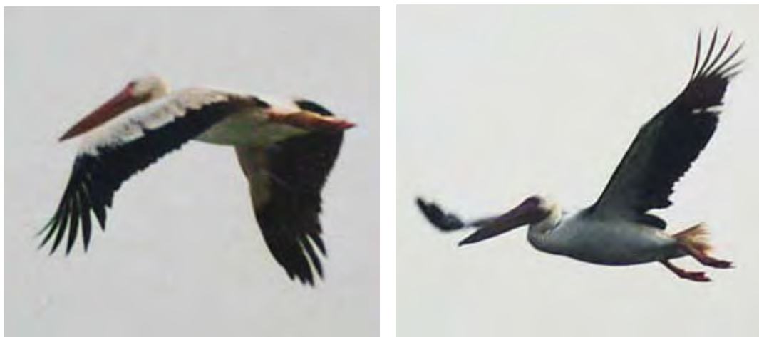
Fig. 12-13. Pelecanus onocrotalus , Sal Rei, Boavista, July or August 2000