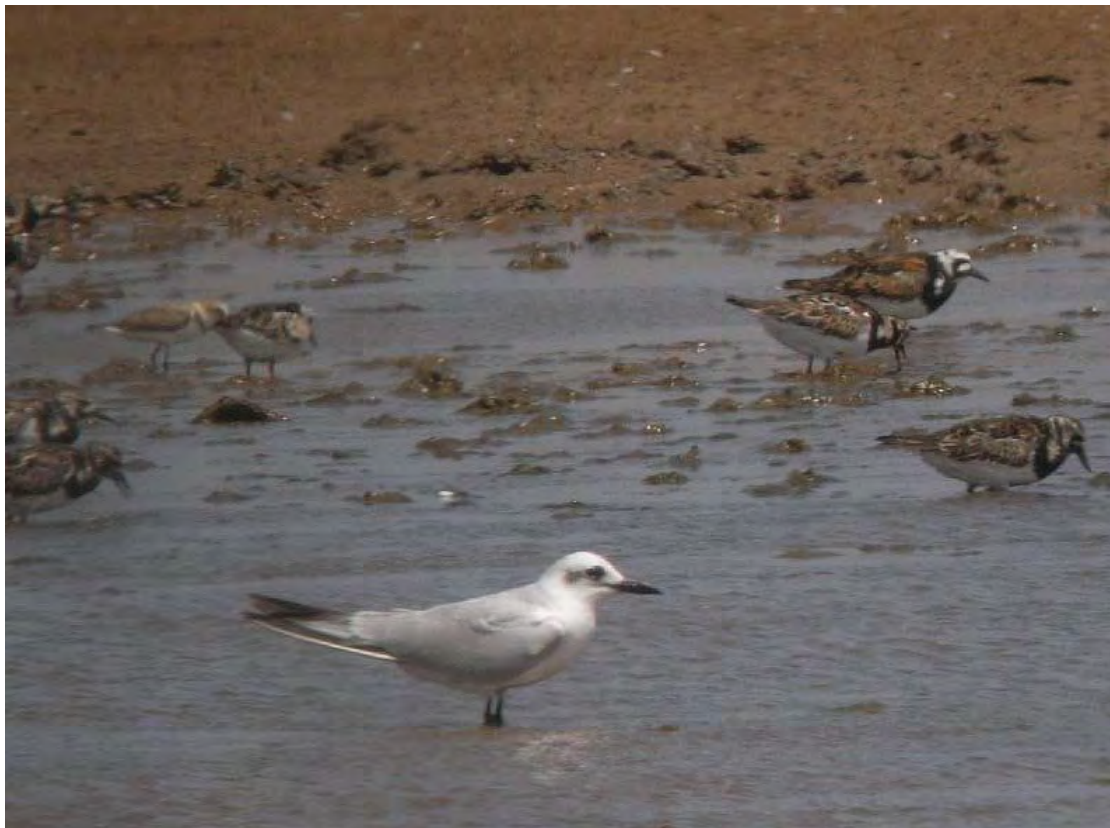
Fig. 27. Gelochelidon nilotica , Ribeira da Lagoa, Maio, 19 April 2009 (Robert Kelsh)

(0, 3) BOAVISTA: 1-2 at Sal Rei and Rabil lagoon, 24-25 December 2000 (TD). Royal Tern has been recorded (December, February-April) from Sal (1), and Boavista (2). Possibly, the record of three long-staying birds at Rabil lagoon, Boavista, 16 March-23 April 2001 (cf. Hazevoet 2003), concerned the same party as those reported here.