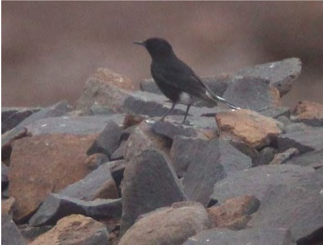
Fig. 36. Oenanthe leucopyga , Cidade Velha, Santiago, 16 January 2005