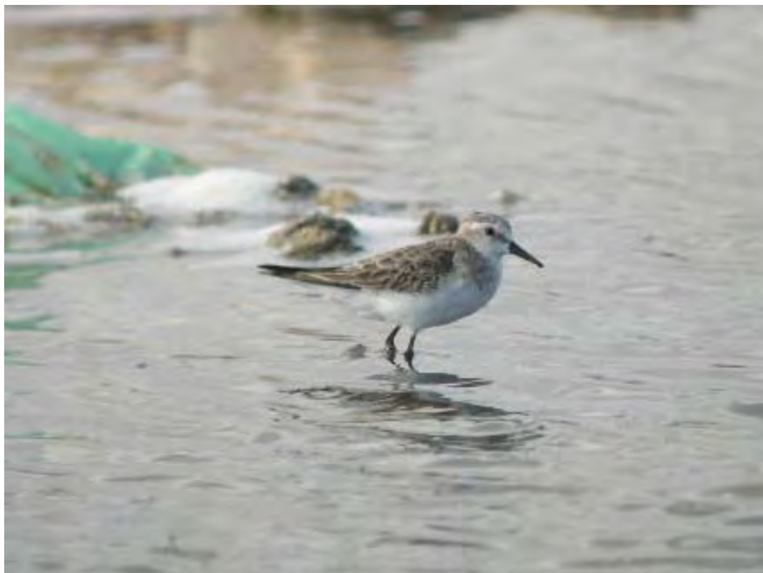
Fig. 23. Calidris bairdii, Santa Maria, Sal, 20 October 2007