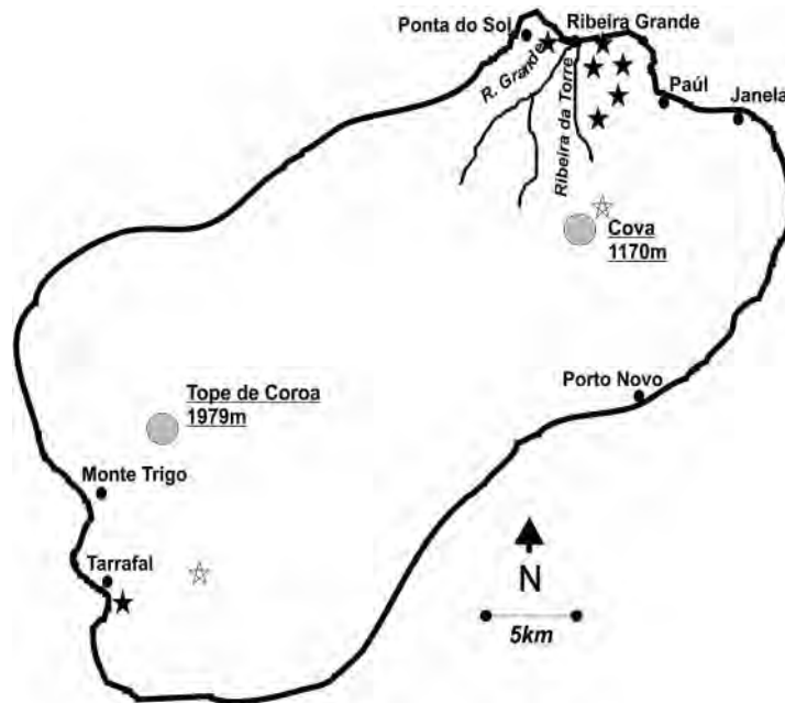
Figure 2. Observations of Cape Verde Red Kites on Santo Antão during the two surveys 1996, 1997 and 1999 (black stars: observations in 1996/97; white stars: observations in 1999).

as harbours, green fields, pig farms, villages and rubbish dumps. Local people, especially farmers, were asked about kite sightings, current or former numbers and behaviour, as well as human attitudes towards raptors.