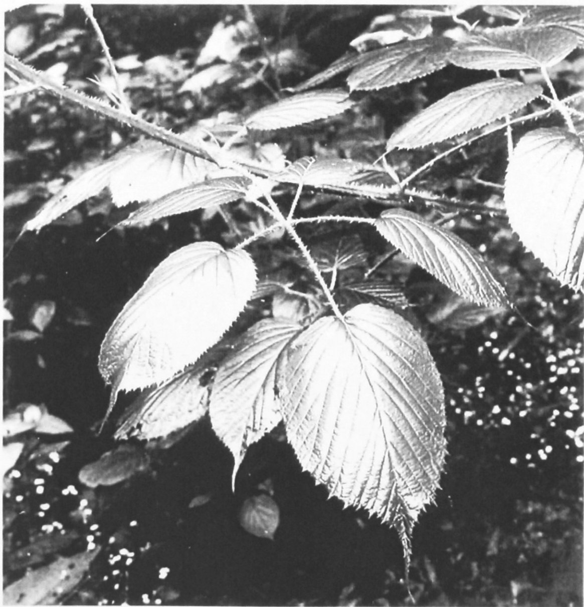
Fig. 3.— Rubus palmensis : Bco. de la Galga, La Palma, 1998, G. Matzke-Hajek.

The "La-Palma-Blackberry" belongs to the series Grandifolii Focke, a group represented