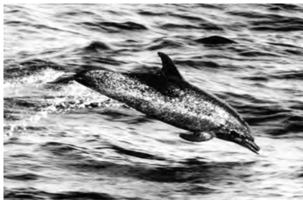
FIG. 1. Adult Stenella frontalis .

The Atlantic spotted dolphin varies geographically in size and degree of spotting (Perrin et al. 1987). In some areas, such as the east coast of the United States and the coast of West Africa, some individuals are so heavily spotted as to appear almost white at a distance, with nearly all the details of the underlying basic pattern obscured. In other areas, for example, north of Cape Hatteras on the east coast of the United States and far offshore in the pelagic western North Atlantic, adults are relatively small and may bear only a very few small and dark ventral spots, usually in the gular region. Some specimens from the Azores have fairly well-developed dorsal spotting but few or no ventral spots. The largest body size is exhibited by animals inhabiting the continental shelf of North America (U.S. east coast, Gulf of Mexico, and Central America),