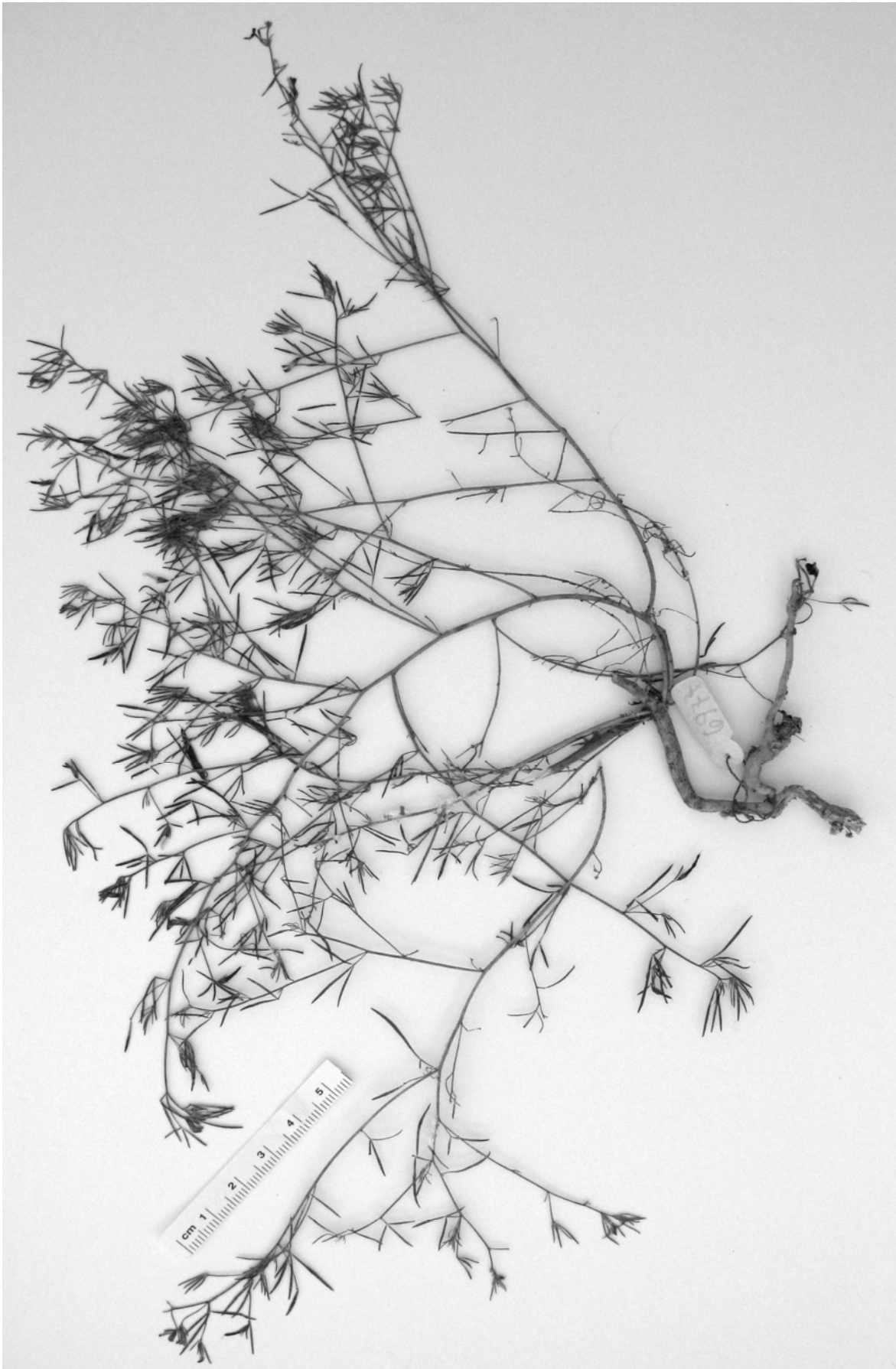
Fig. 1. Lotus alianus (from L.A. Grandvaux Barbosa 6977, LISC): Habit.