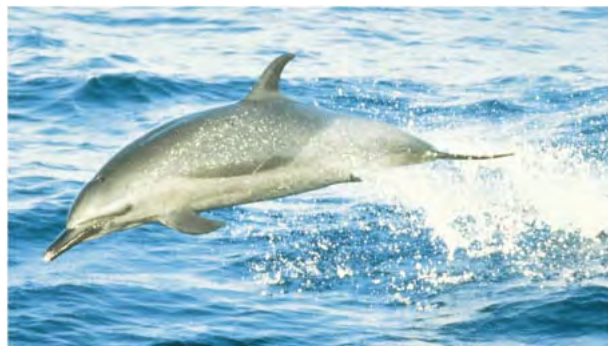
FIG. 1. Gray's pantropical spotted dolphin ( Stenella attenuata attenuata ) from the eastern tropical Pacific.

Eye stripe encloses a black eye spot and extensions of the eye spot as a black line (a few mm wide) occur forward to apex of melon (Perrin 1997). The entire eye stripe may be bordered by a narrow light line. Blowhole stripe is relatively narrow and may be composed of subelements. Intersection of anterior end of flipper stripe and lip mark is demarcated by a narrow light line. Ventral margin of flipper stripe may be bordered by a narrow light line and subtended by a parallel narrow dark line. A light-gray band (4–6 cm) may parallel the ventral margin of the cape. In heavily spotted individuals of the eastern Pacific coastal subspecies, the ground pattern may be nearly obscured dorsally. Spotting may extend to