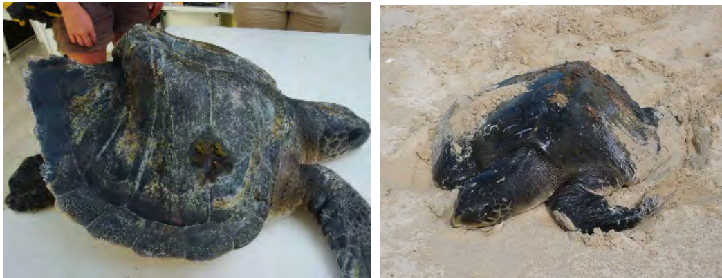
Fig. 3. Olive ridley Lepidochelys olivacea with deformed carapace, captured off Santa Maria, Sal, 27 November 2010. Fig. 4. Olive ridley, Atalanta beach, Boavista, 28 March 2011.

Table 1 summarizes information of records of olive ridley sea turtles in the Cape Verde Islands. Information obtained from photos and measurements taken of some individuals show that records no. 1 and 7 were the smallest turtles recorded, their size being indicative of juveniles (cf. Fretey 2001). These two records are of