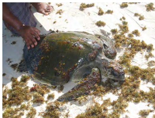
Fig. 1. Olive ridley Lepidochelys olivacea , found at Atalanta beach, Boavista, 4 November 2004. Fig. 2. Olive ridley, Baía Grande, Boavista, 26 January 2010.