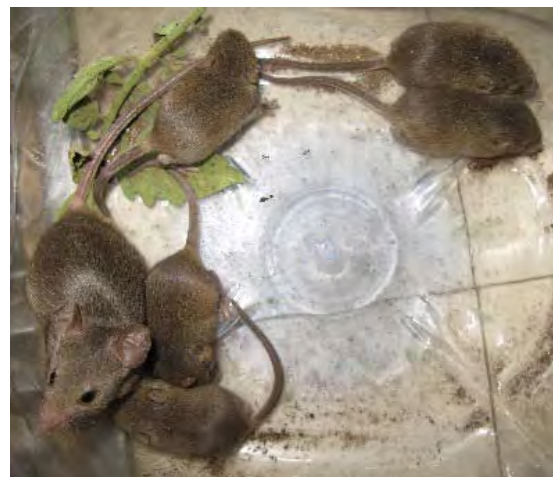
Fig. 6. House mouse Mus musculus , adult and young, Porto Novo, Santo Antão, 28 April 2008 (Simon Baliteau).

Rats Rattus sp. have been reported from several islands, but it has not always been clear whether this concerned the black rat R. rattus (L., 1758) or the brown rat R. norvegicus (Berkenhout, 1769). On Santiago, the presence of brown rats was confirmed in the capital Praia during the 1990s (CJH pers. obs.) and in the Serra Malagueta during the years 2006-2007 (Cesarini et al. 2008). It is likely that brown rats also occur elsewhere on the island. During the years 1988-2010, brown rats were occasionally seen in the harbour region of Mindelo on São Vicente (CJH pers. obs.). The presence of black rats has been confirmed on Santiago, i.e. at Trindade (Heim de Balsac 1965, de Naurois 1969, 1982), São Domingos (Rabaça & Mendes 1997) and in the Serra Malagueta (Cesarini et al. 2008). Unidentified rats Rattus sp. have been reported from Brava, Santo Antão, São Nicolau, Boavista and Maio by our correspondents (see Acknowledgements) and from Fogo by Siverio et al. (2008).