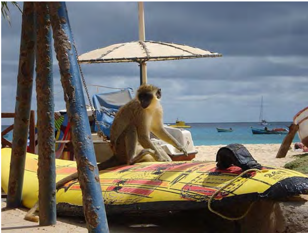
Fig. 5. Green monkey Chlorocebus sabaesus kept as a pet, Santa Maria, Sal, 24 March 2008.