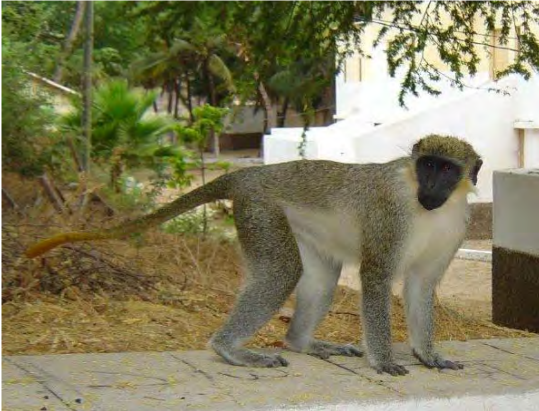
Fig. 4. Green monkey Chlorocebus sabaesus , Tarrafal, Santiago, July 2005 (Juan Roch).