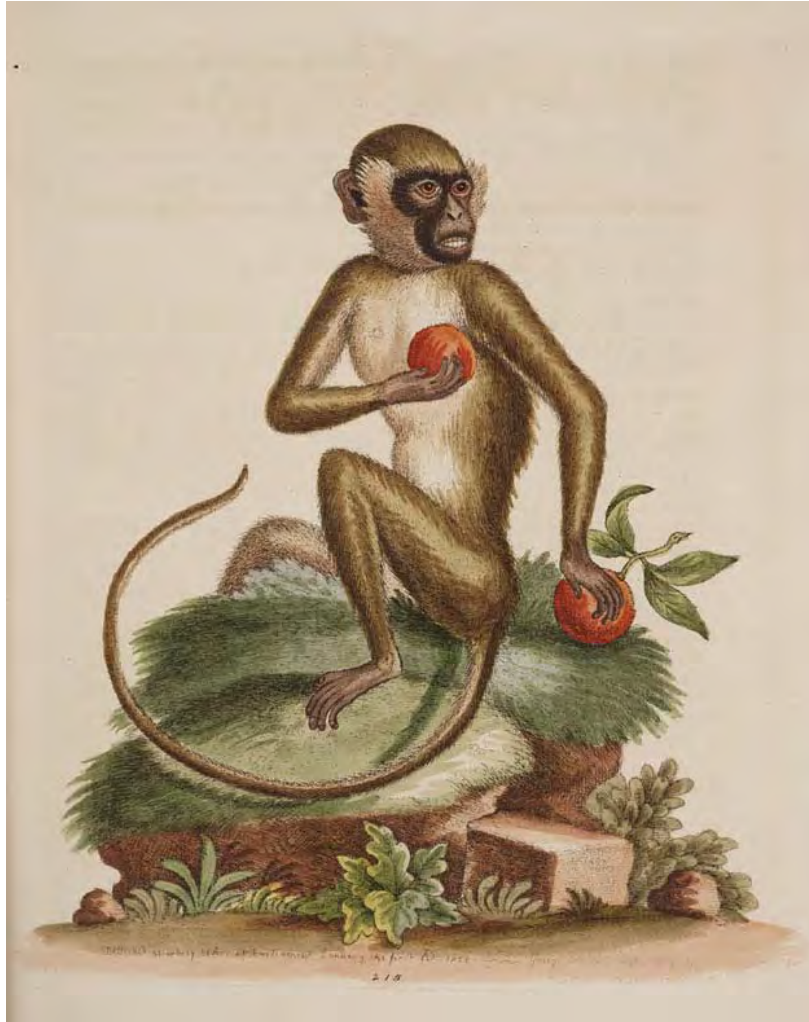
Fig. 2. The St. Jago Monkey, as depicted in Plate 215 of George Edwards' (1758) Gleanings of Natural History , on which Linnaeus (1766) based his Simeia sabaena .

and remarking that “it’s often called the green monkey”, but “our seamen generally call them St. Jago monkees, they being brought from St. Jago, one of the Cape de Verde Islands” (Edwards 1758: 10).